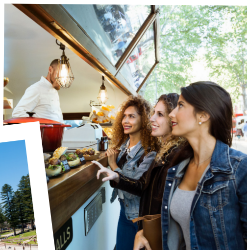
The world's cuisine in one location!