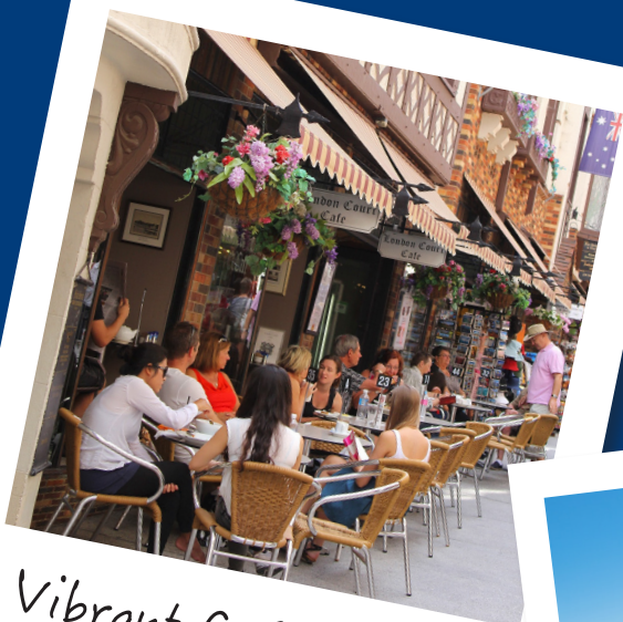
Vibrant Cafe Culture