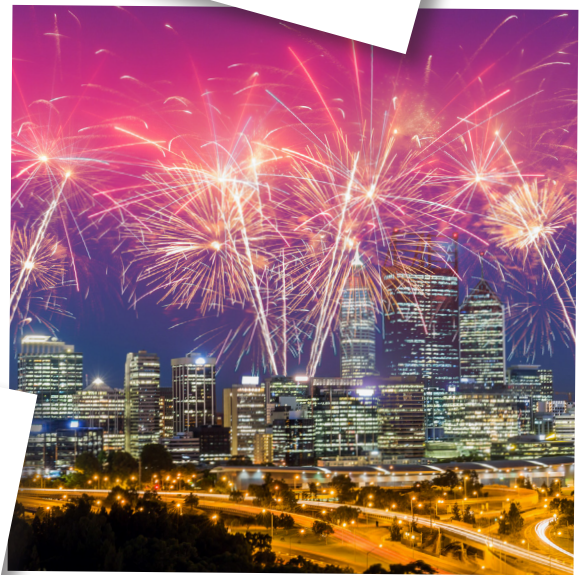
Festivals and Celebrations