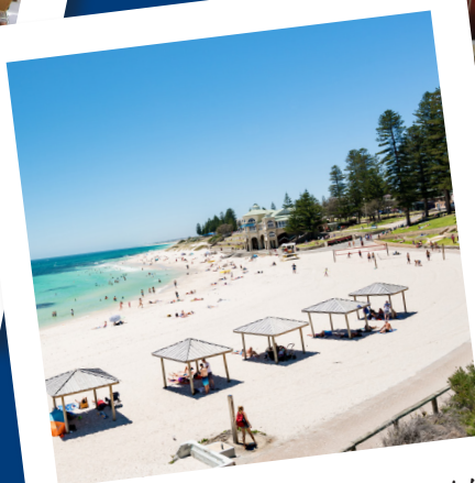
The best beaches imaginable