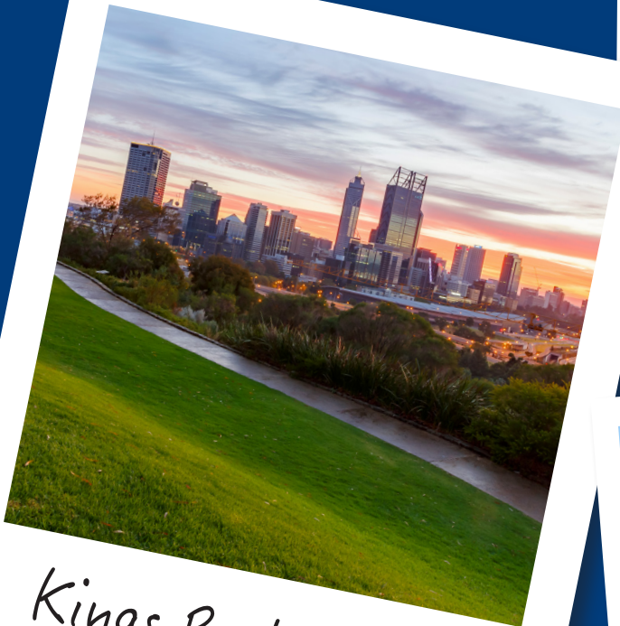
Kings Park, Perth